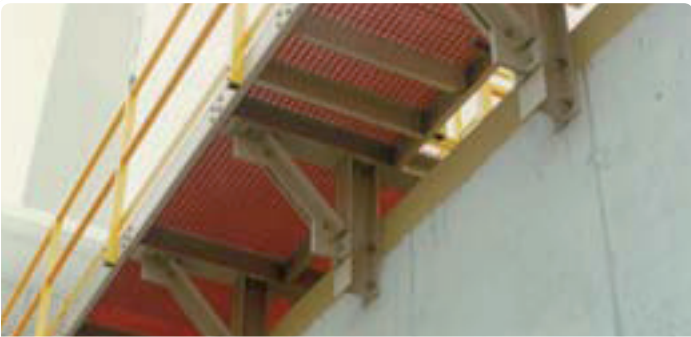
Platform Power plant