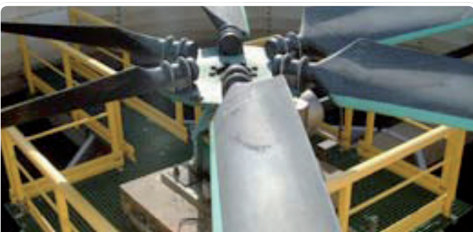
Entrance platforms Cooling tower