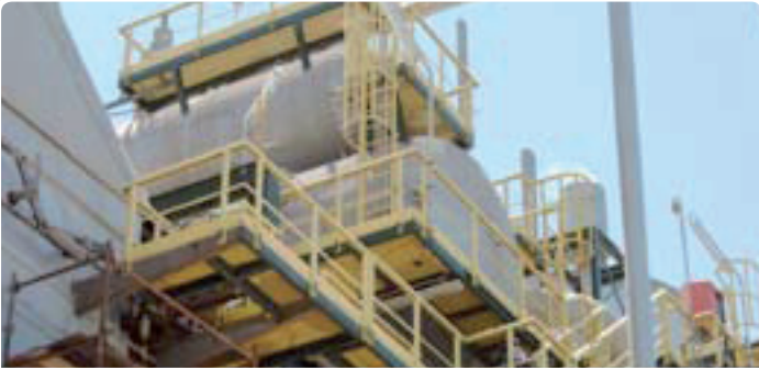
Customized secondary structures Process industry