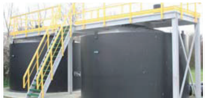
Entrance platforms Water treatment plant