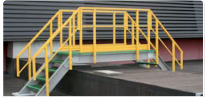
Step over platform Food and beverage industry

Fiberstruct's GRP constructions are being used in (petro-) chemical industry, marine, offshore, oil- and gas companies and powerplants. Our advanced detail engineering is done with TEKLA 3D design software. This is not the only aspect in which you will recognize our strength. The technical knowledge and experience of our crew enables us to meet standards demanded by our clients. The project list below gives a good impression of the technical possibilities that Fiberstruct can offer.