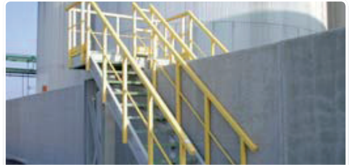
Step over platform Chemical tank storage